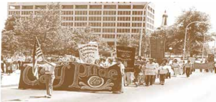
First Pride Parade In Worcester 1975

of Public Health. The first marriage licenses for same-sex couples were issued in 2004. As of 2015, same-sex marriage is legal in all fifty states due to a ruling from the Supreme Court. Pride is a wonderful time of the year where you are able to fully and unapologetically be who you are, love who you love and find a community that accepts you as you are. The struggles continue but we face these challenges head on, and trusting always that love wins over all. For more information on Pride events in Worcester you can visit the Pride Worcester website at: prideworcester.org