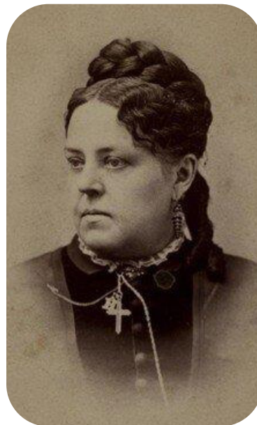
Esther Howland (1828 - 1904)