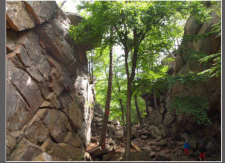
Inside the Chasm