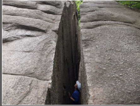
Fat Man's Misery!