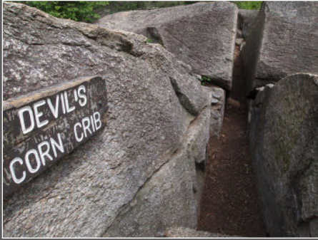
Devil's Corn Crib