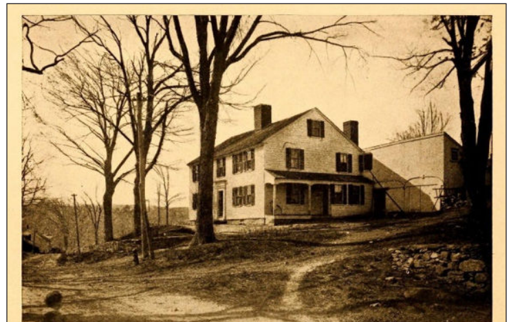
SARGENT HOUSE, CHERRY VALLEY. Where the "Minute Men" halted to receive bullets made from clock weights.

opment, Leicester is part of the Blackstone River Valley National Heritage Corridor.