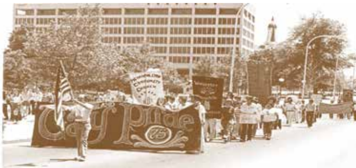
First Pride Parade In Worcester 1975

Community Church and the Worcester Homophile Organization, which was formerly known as the Worcester Gay Union. Now, nearly 50 years later, from Worcester's first Pride Week, the tradition continues with a large festival in downtown Worcester and two weeks of LGBTQIA+ centered events for all different age groups. While