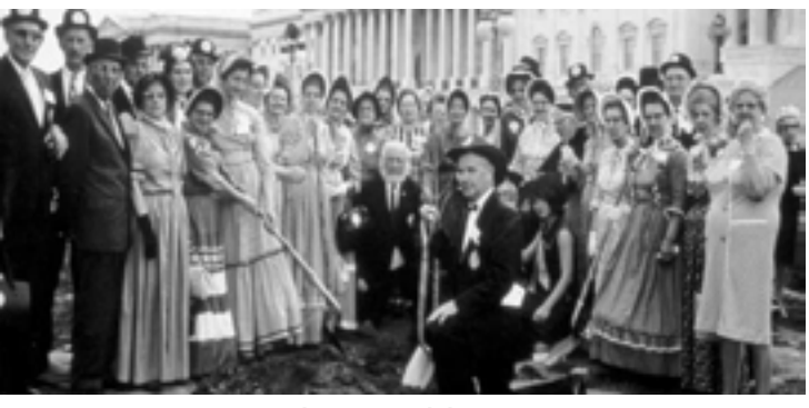
Arbor Day Celebration