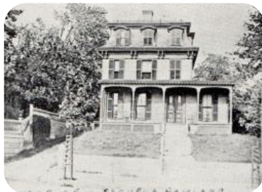
Howland House, 68 Summer St.