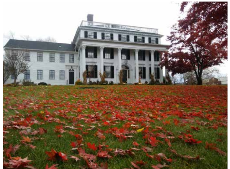
Asa Water Mansion

Not withstanding the mills and mall, Millbury still maintains that quaint "Mayberry" hometown feel with its local shops and restaurants. I have personally tried Penny Pinchers brewery, Pizza Chef, The Coop, Calabria and A&D, to name just a few. Or Take a leisurely stroll downtown and enjoy the scenery. Make yourself at home in Millbury