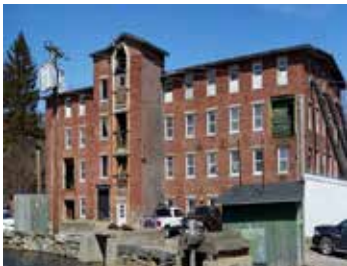
S&D Spinning Mill