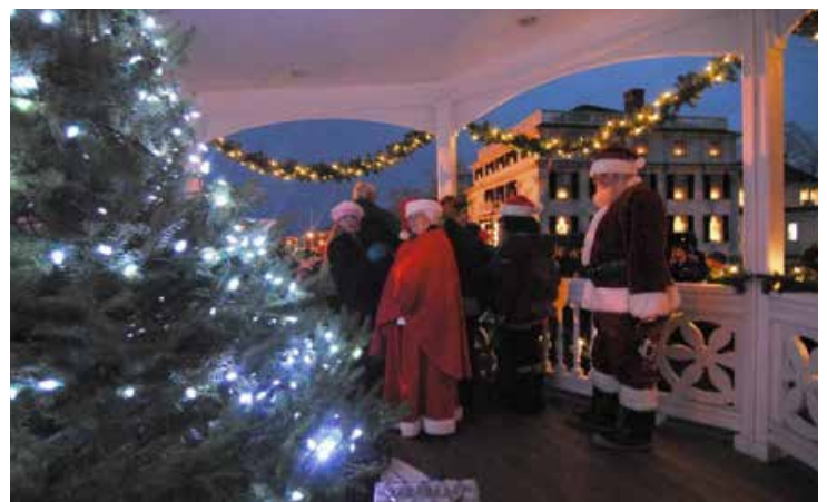
Don't forget the Millbury Chain of Lights, on Sunday, December 3, 2023