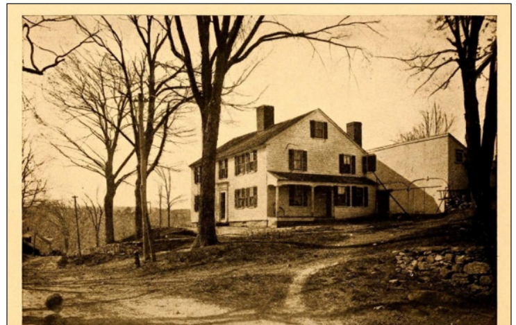
SARGENT HOUSE, CHERRY VALLEY. Where the "Minute Men" halted to receive bullets made from clock weights.

opment, Leicester is part of the Blackstone River Valley National Heritage Corridor.