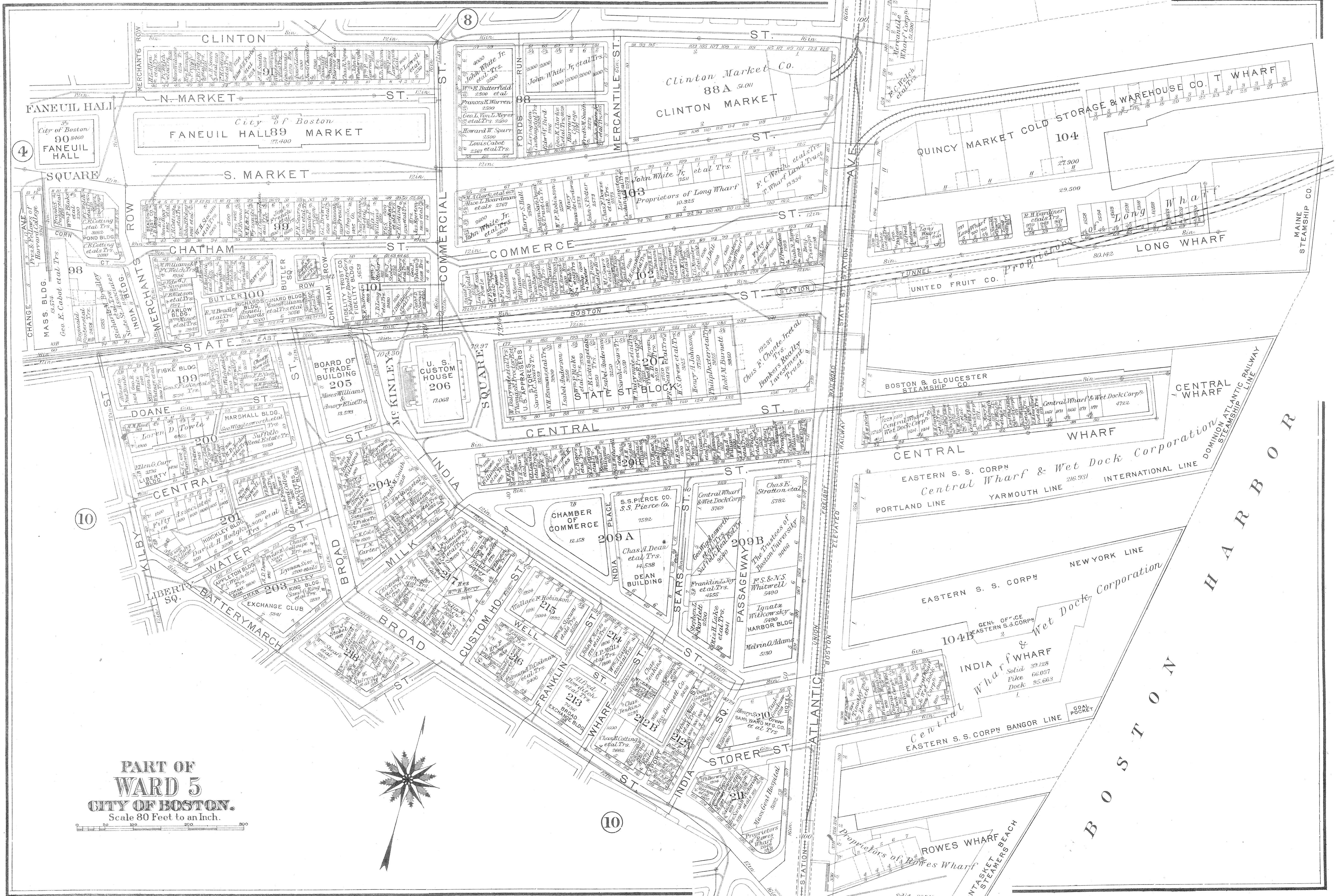
PART OF WARD 5 CITY OF BOSTON. Scale 80 Feet to an Inch.