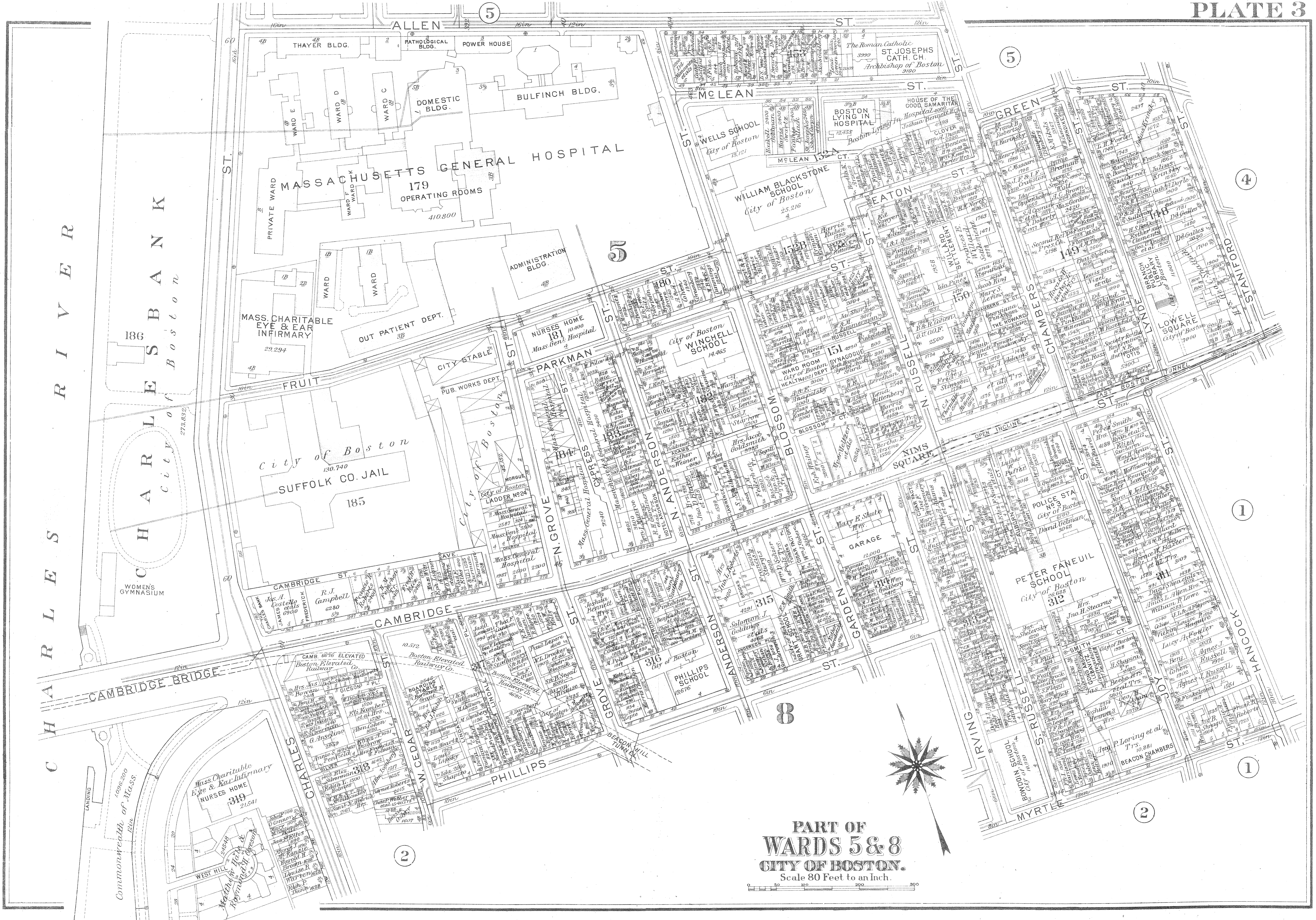
PART OF WARDS 5 & 8 CITY OF BOSTON. Scale 80 Feet to an Inch.